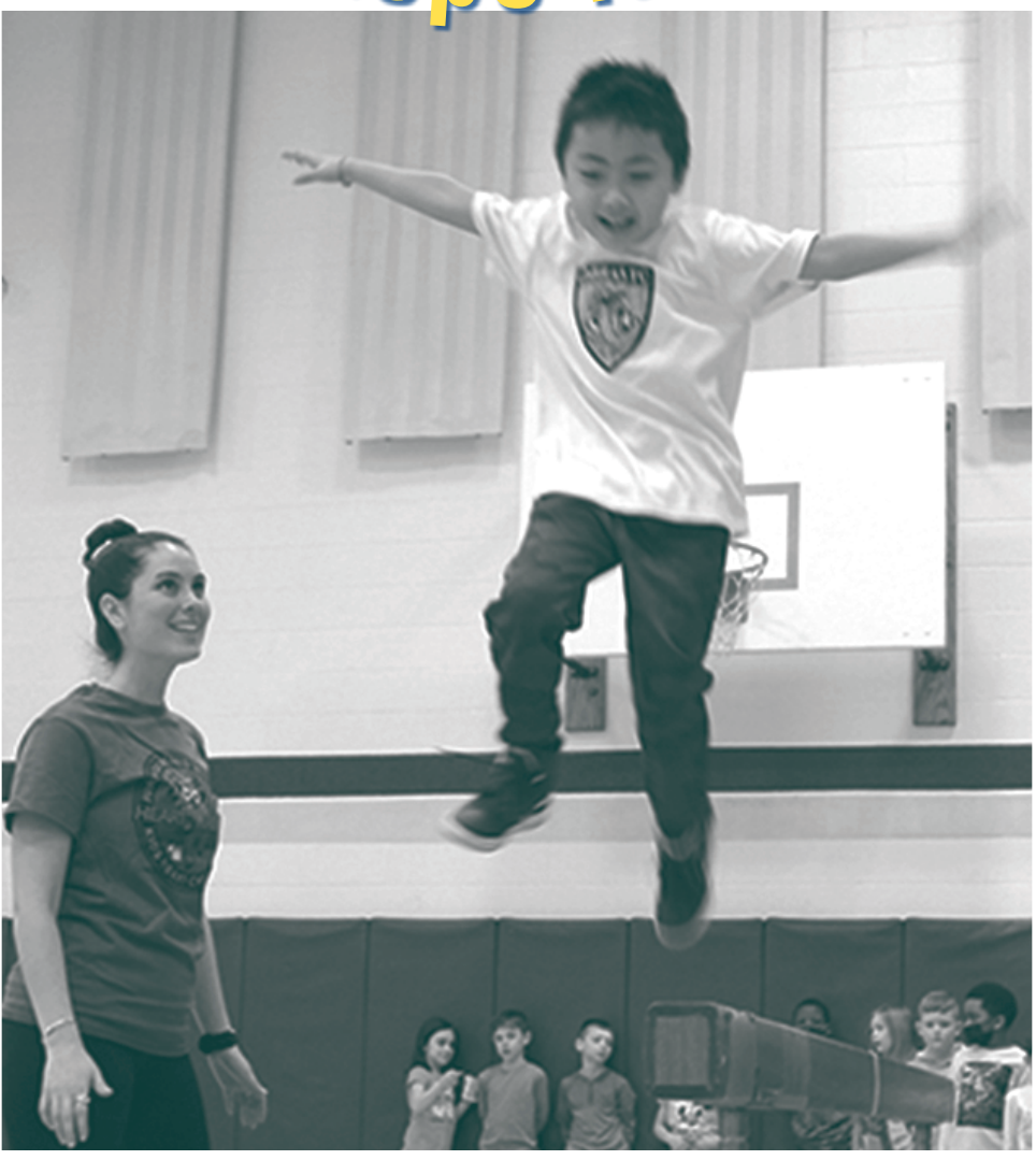
Students, staff and families at Taylor Elementary School raised more than $8,400 for the American Heart Association through the Jump Rope for Heart program. On March 11, students at all grade levels engaged in healthy exercises, games and activities to cap off the effort.