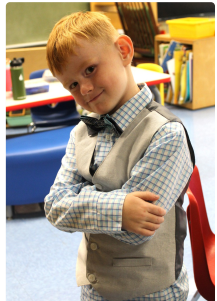
Dress Your Best Day