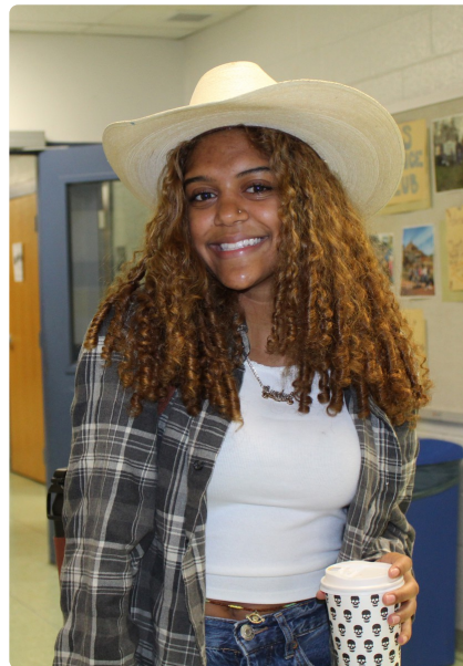
Music Genre Day