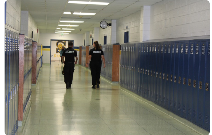
Safety and security