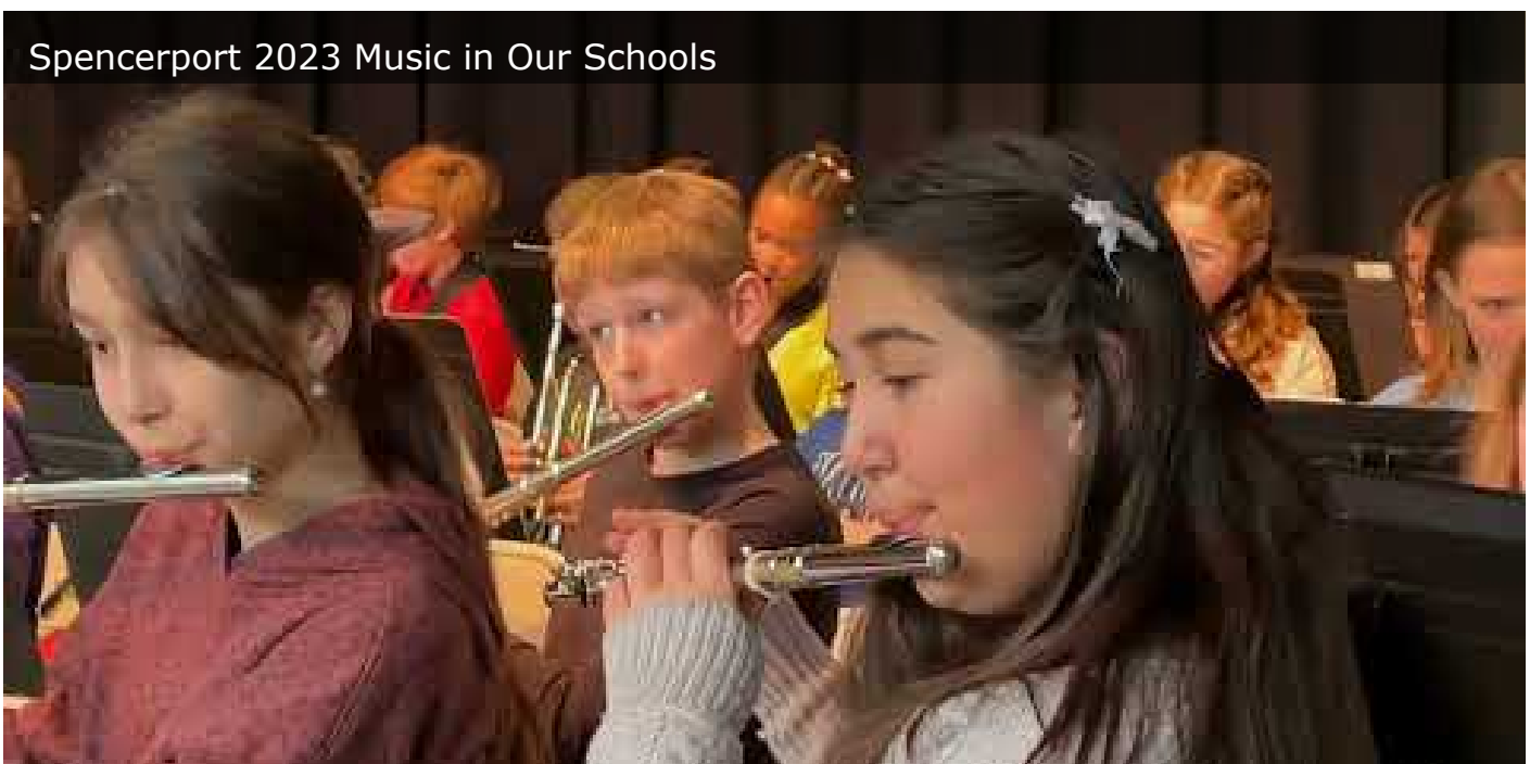
Spencerport 2023 Music in Our Schools

Today marks the end of Music in Our Schools Month. The concerts, music festivals, and show productions lifted us all, and we could not do it without our music educators. They inspire students to learn new instruments, find their voice, and connect with classmates through music. I hope you enjoy the video below which highlights our program and demonstrates the importance of music education in our district. Thank you to our teachers, support staff and families for the work you do to provide our students with the ability to learn and grow through music.