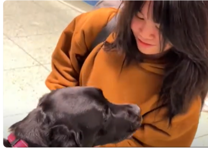
Mental health supports